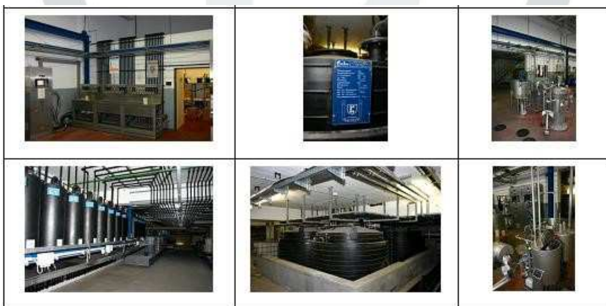
Figure 1: The use of NaOH in today's textile industry is in closed system without exposure of the workers (left: Distribution NaOH, middle; Storage of NaOH, right: Use of NaOH (dying))